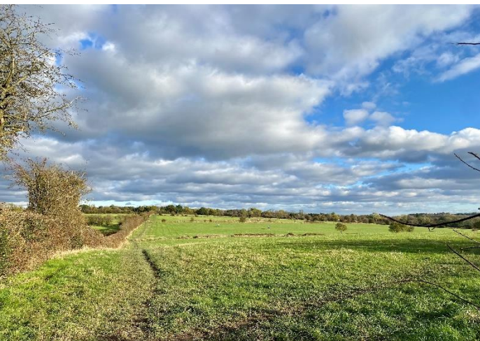
The Hayes – where my residential was based

But ultramarathons can be done in other ways than running. Like when you are on a full residential week. To be very honest, I was absolutely looking forward to the residential, but not so much being away for a whole week. I sensed the intensity and was dreading a bit. And it was beyond my imagination.